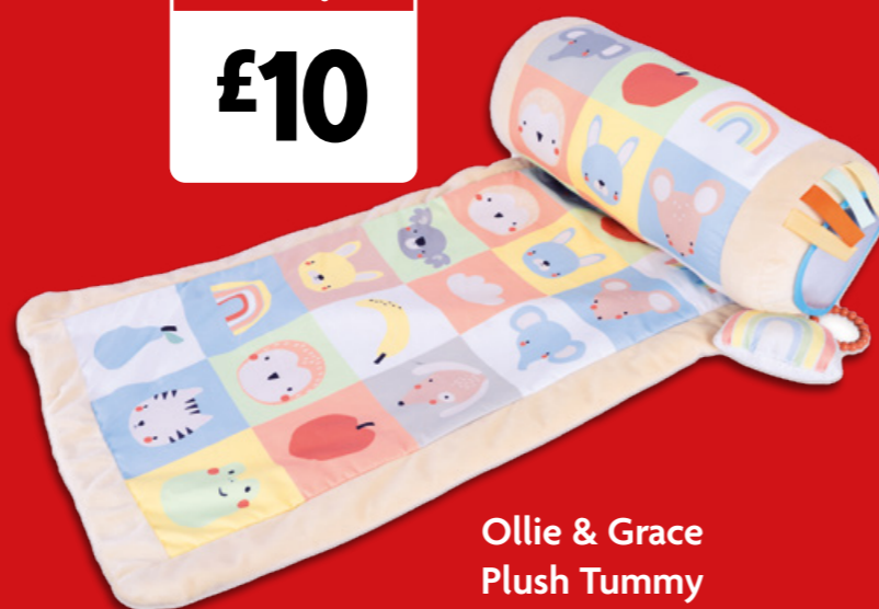
Ollie & Grace Plush Tummy Time Roller