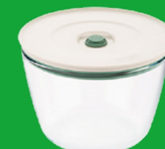
Round 1600 ml