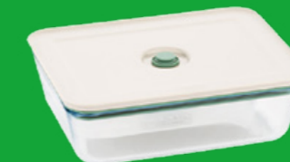
Rectangular 1500 ml