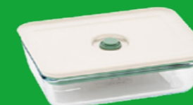
Rectangular 800 ml