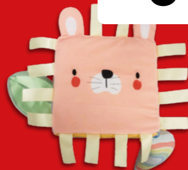
Ollie & Grace Plush Cube