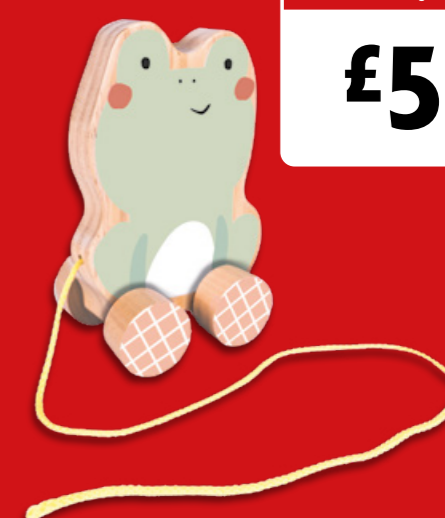
Ollie & Grace Wooden Pull-a-Long