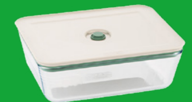
Rectangular 2600 ml