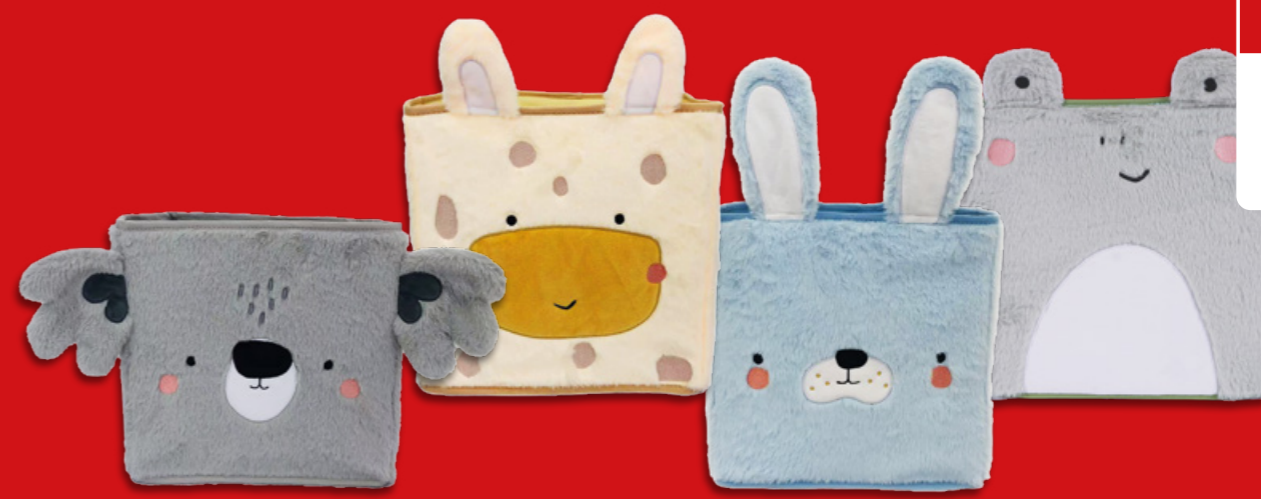
Ollie & Grace Plush Storage Cubes