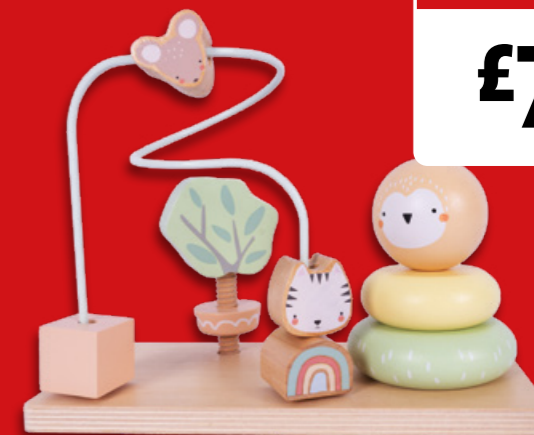
Ollie & Grace Wooden 3 in 1 Activity Board