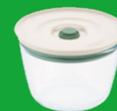
Round 600 ml