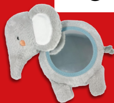
Ollie & Grace Plush Mirror Toy