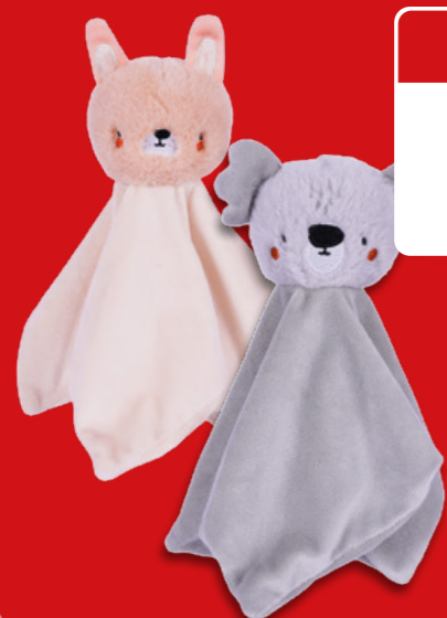
Ollie & Grace Plush Comforter