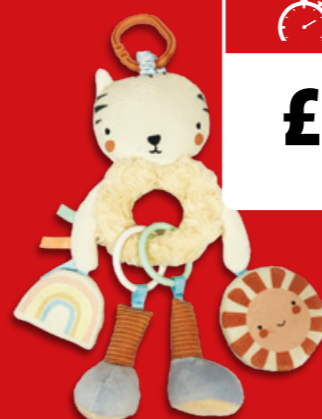
Ollie & Grace Sensory Plush