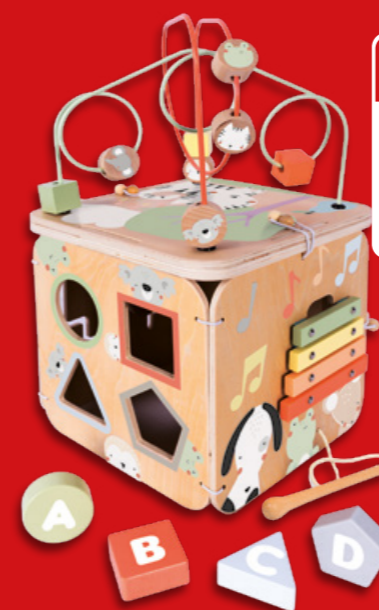
Ollie & Grace Wooden Activity Cube