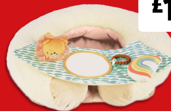
Ollie & Grace Sit & Play