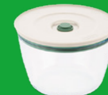
Round 1100 ml