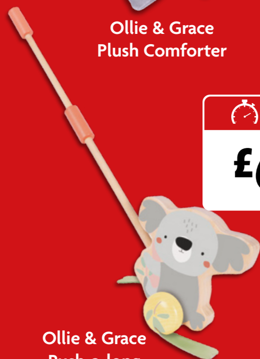
Ollie & Grace Push-a-long