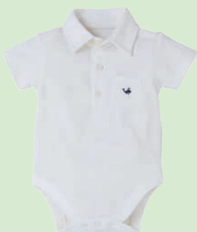
Cream polo bodysuit, £4 Newborn-24 Months