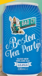
Boston Tea Party 330ml