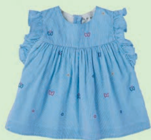
Butterfly embroidered shirt, £6 Newborn-24 Months