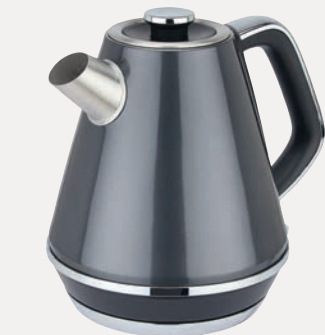
Anthracite Kettle, 1.7L, £35 Any 2 for £60