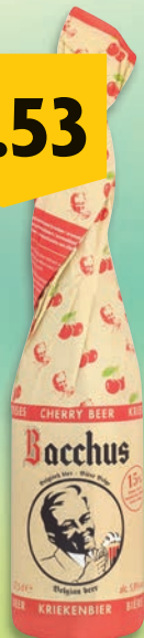
Bacchus Kriek 375ml