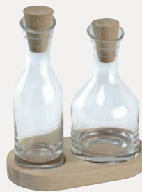
Oil and Vinegar Server, £7