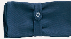
Cotton Napkins, 4 pack, £6