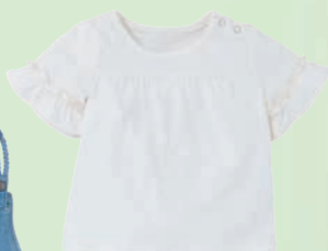
Floral dungaree with cream t-shirt, £10 Newborn-24 Months