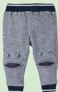
Grey jogger, £5 Newborn-24 Months