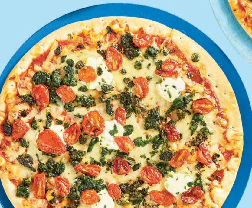
Italian Spinach and Ricotta £3.50 535g

With Mediterranean flavours and an authentic, thin stonebaked base, enjoy our new Italian pizzas - a lighter, vegetarian eat, perfect for warmer weather.