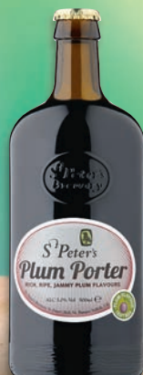
St Peter's Plum Porter 500ml