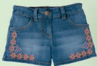
Aztec denim shorts, from £8 4-14yrs