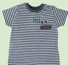
Striped t-shirt, £3.50 Newborn-24 Months

Whatever your little one's style, you'll find comfy, fashionable clothes they'll love to wear.