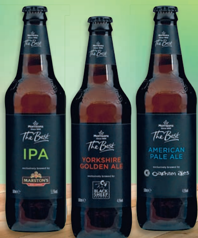
The Best IPA, Yorkshire Golden and American Pale Ale 500ml