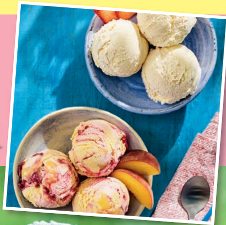
Peach and Raspberry Ice Cream, £2 each, or 2 for £3 900ml tubs

Discover our new flavours of ice cream from Salted Caramel to Sweetshop, inspired by bubblegum & candyfloss flavours.