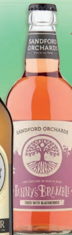
Sandford Orchards Fanny's Bramble 500ml

Discover our selection of British, imported and craft ciders and choose from regional ales, craft beer, world beer and kegs. Look out for our tasting notes in store to help you select your perfect tippie.