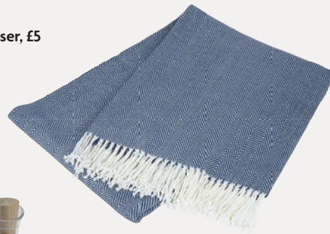
Indigo Herringbone Throw, £18