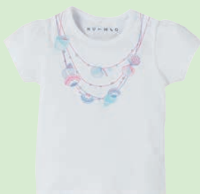
Mermaid top, £2.50 Newborn-24 Months