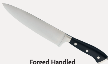
Forged Handled Chef's Knife, £9