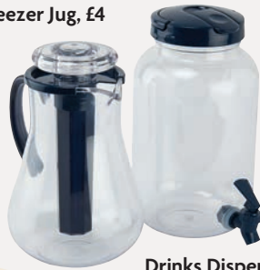
Drinks Dispenser, £5