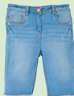
Knee length denim shorts, from £6 1-6yrs