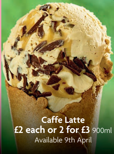
Caffe Latte £2 each or 2 for £3 900ml Available 9th April