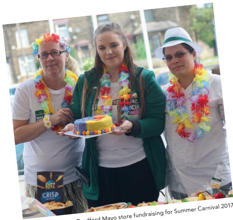
Bradford Mayo store fundraising for Summer Carnival 2017