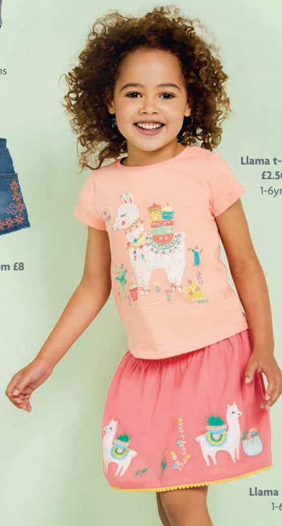
Llama t-shirt, £2.50 1-6yrs