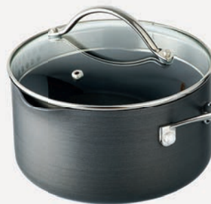
Hard Anodised 20cm Pan with Lid, £18