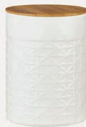
Geo Embossed Canisters, £6 each