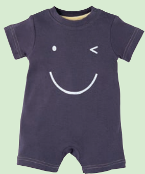
Wink face romper, £4.50 Newborn-24 Months