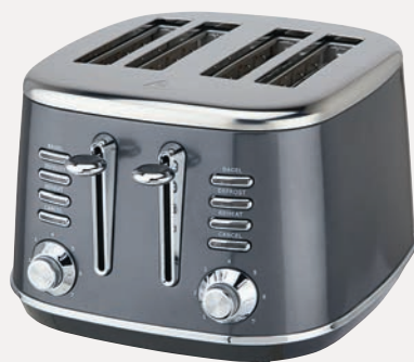
Anthracite 4 Slice Toaster, £35 Any 2 for £60