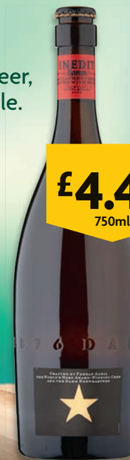
Damm Inedit 750ml