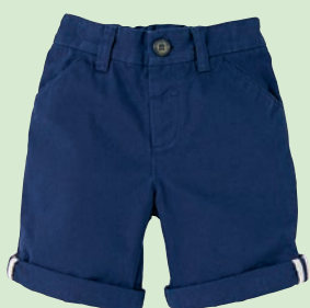
Denim shorts, from £5 1-6 years