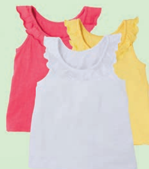
3 pack frill sleeve vest, from £6 1-6yrs