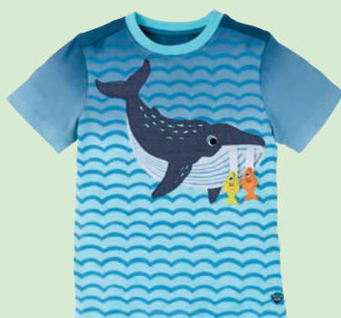
Shark top, from £5 1-6 years