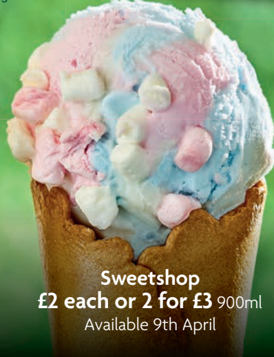
Sweetshop £2 each or 2 for £3 900ml Available 9th April