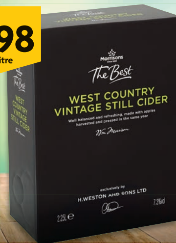
The Best Vintage Cider 2.25 litre