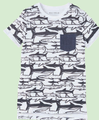
Shark top, from £4 4-14yrs