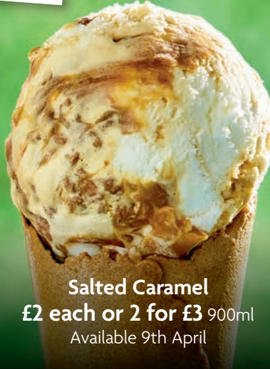
Salted Caramel £2 each or 2 for £3 900ml Available 9th April