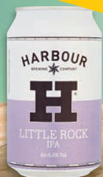
Harbour Little Rock IPA 330ml