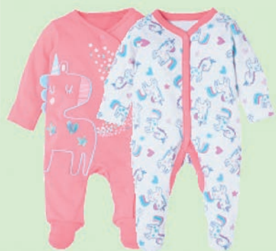
Unicorn sleepsuit set, £8 Newborn-18 Months