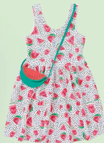
Watermelon dress and bag, from £10 4-14yrs