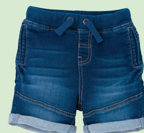
Jersey waist shorts, from £7 4-14yrs