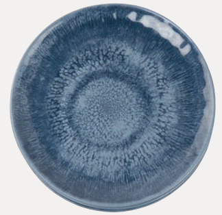
Crackle Serving Plate, £3