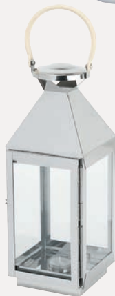
Small Chrome Lantern, £12