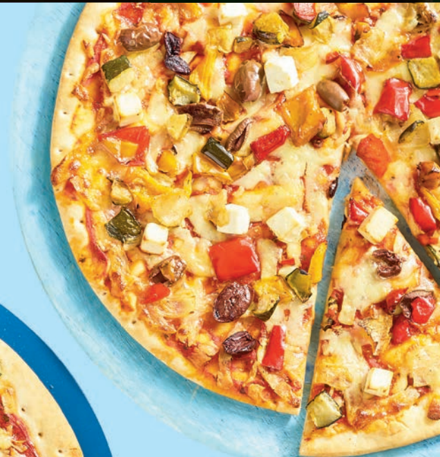
Italian Chargrilled Veg £3.50 545g

Pizzas available 9th April Available online 23rd April