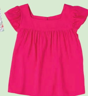
Pink t-shirt with sleeve detail with Aztec skirt, from £12 4-14yrs